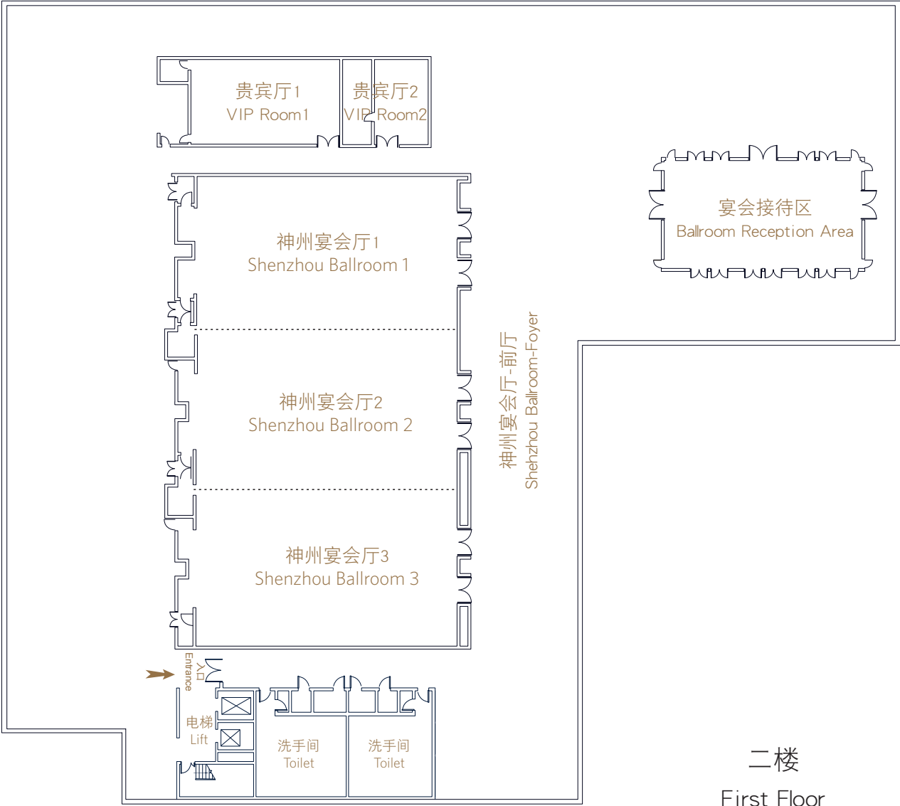
二楼 First Floor